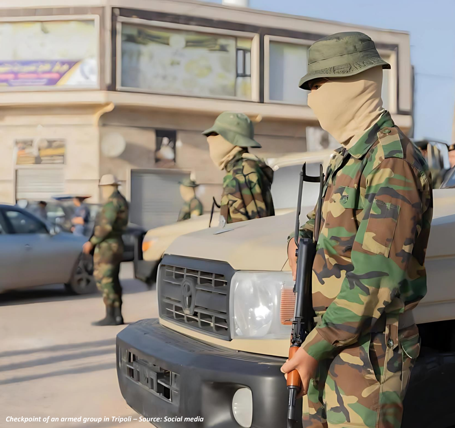
Checkpoint of an armed group in Tripoli