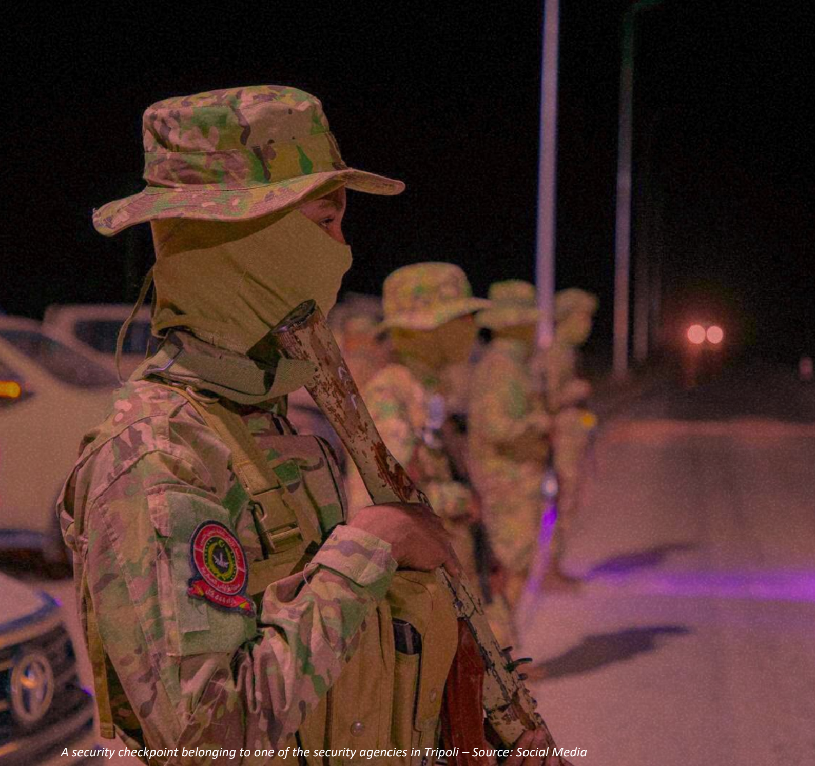
A security checkpoint belonging to one of the security agencies in Tripoli