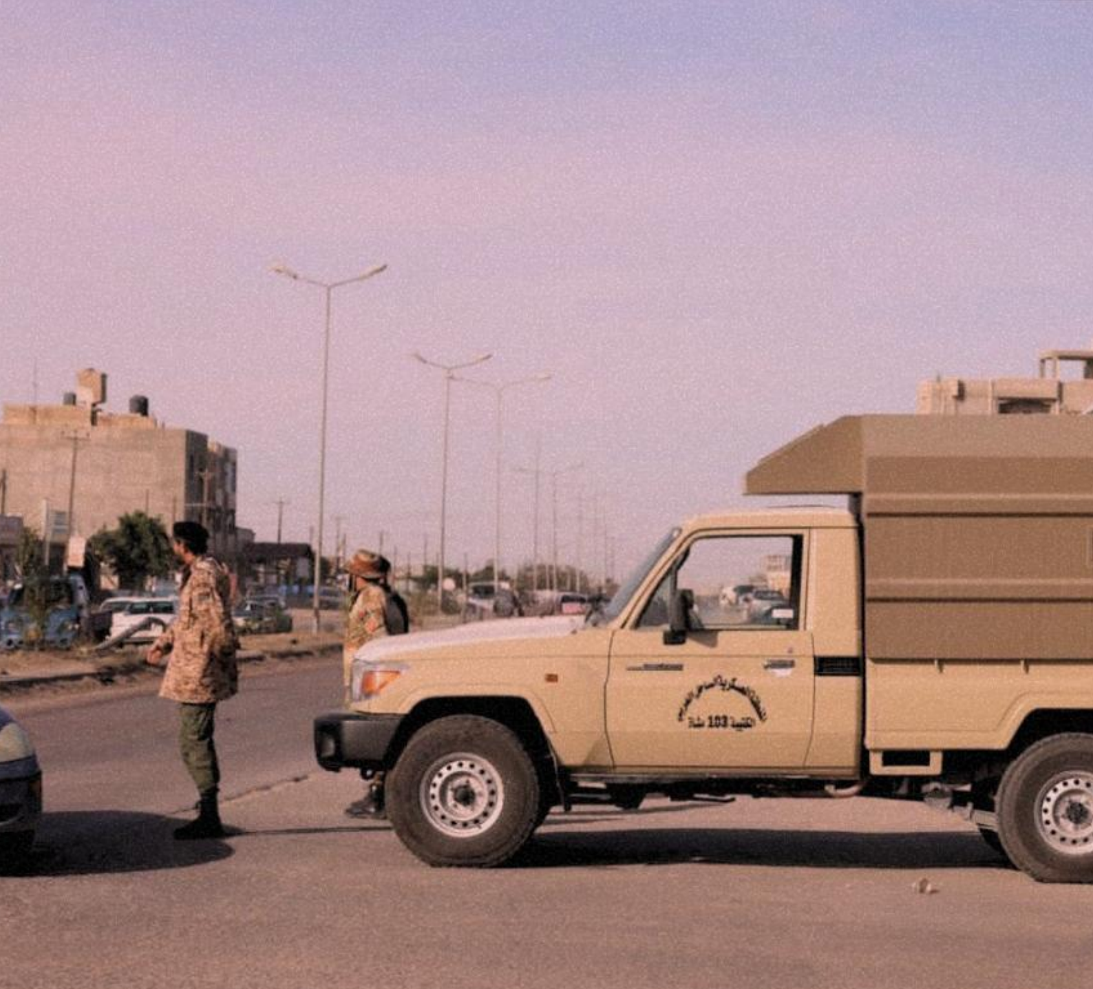
A security checkpoint belonging to one of the armed groups in Western Libya