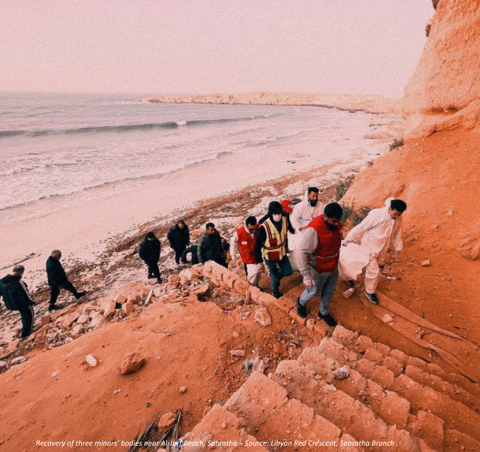
Recovery of three minors' bodies near Al-Jurf Beach, Sabratha